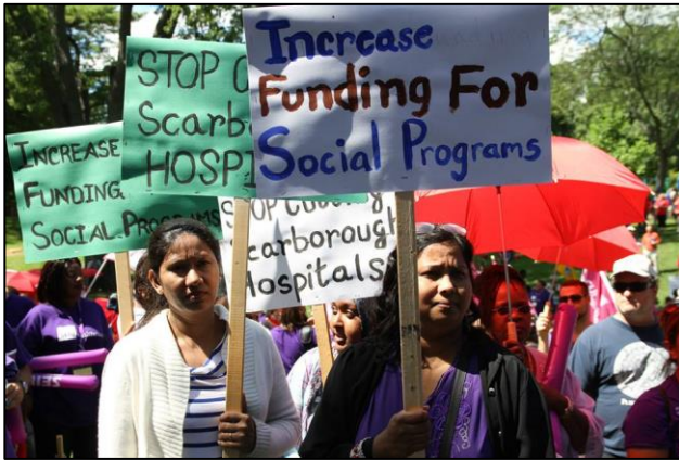
Scarborough activists joined the crowds in Niagara-On-the-Lake this summer at the Council of the Federation to protest cuts to their local hospitals.