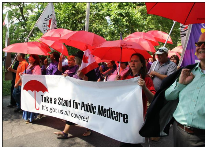
Thousands joined the Ontario Health Coalition Summit at the Council of the Federation this Summer in Niagara-On-the-Lake to call on the federal government to renew Canada's Health Accord and protect Public Medicare